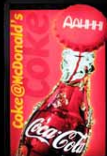
...Coke by night!