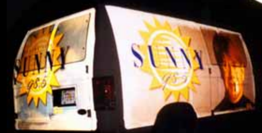
Fleet Full-Wrap (Ink-Jet) Photos Courtesy of Genesis Digital Images Inc.