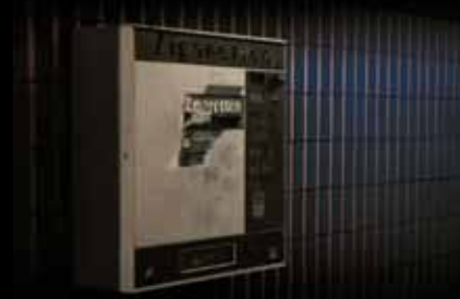
An ugly dispensing machine