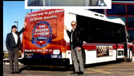
Transit Back-Wrap (E-Stat)