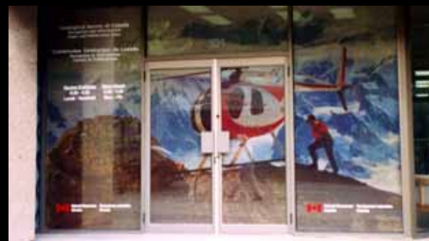
Gov't P.O.P. (E-Stat)