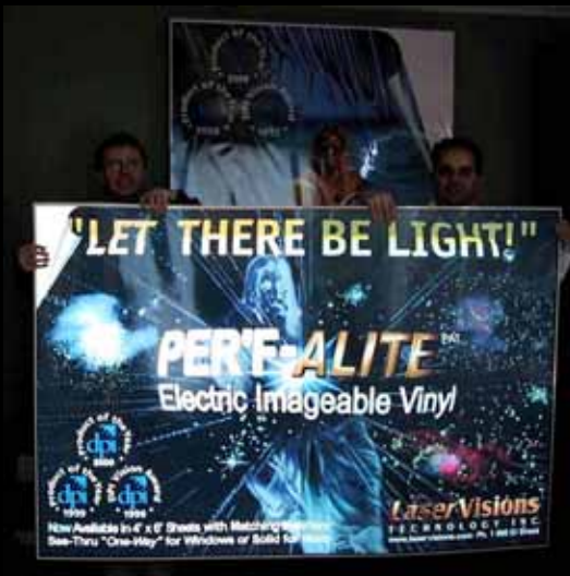
Now you see it....

Weather-All Overlaminates takes over where E-Tape TM leaves off, providing superior all-over protection for all environmentally exposed vinyls! It's a clear, flexible, thin film that is truly optically clear with a special adhesive backing that will conform to today's curved glass common on most fleet vehicles. Unlike some coatings and laminating films, Weather-All TM Overlaminates resists attack from weather, chemicals, oils, food products, mildew even strong cleaning detergents and solvents and is anti-graffiti. Weather-All TM Overlaminates also resists scratching and hazing due to cleaning and handling. Your print supplier can apply it with standard cold-laminating equipment, and it's compatible with most inks and toners and with a wide range of print media. You'll get a better return on your investment because your graphics will keep their original high impact longer than ever before.