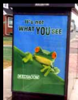
Bus Shelter Advertising