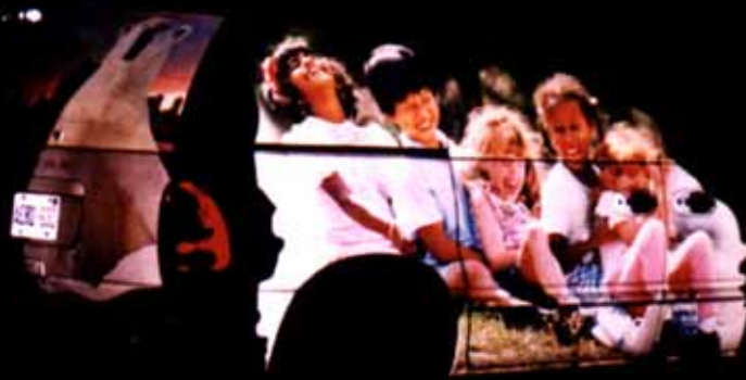
Fleet Full-Wrap (E-Stat)

Specify our new premium Retro-Reflective Engineering Grade film . This is only available from Electric Vinyl . Available in matched set perforated and non-perforated for the Total Fleet and Transit Advertising solution, Building Wraps too! We have numerous product lines that are compatible with Solvent Ink-Jet, E-Stat, Silk Screen and Thermal Transfer.