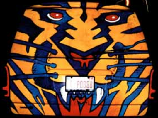
Fleet Back-Wrap for Florida Panthers (E-Stat)