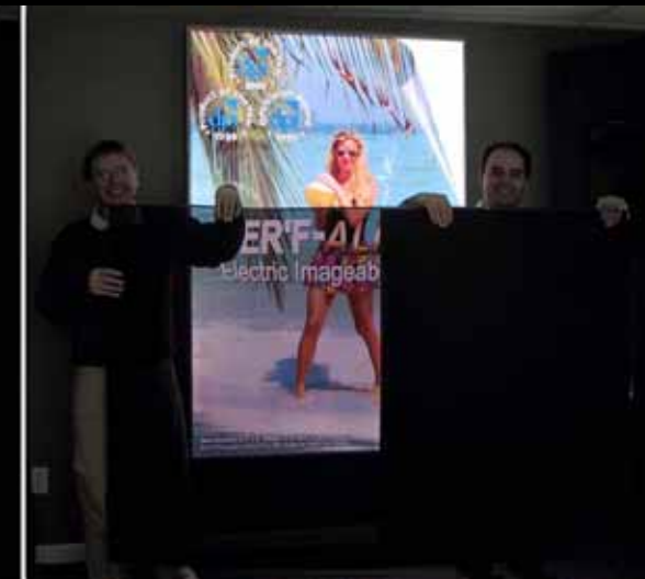
.....Now you don't