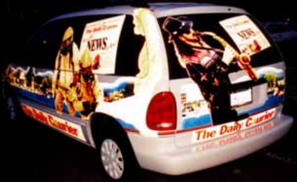
Fleet Wrap (Ink-Jet)