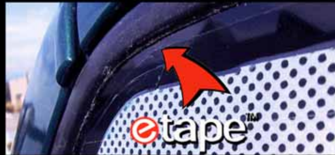
e tape TM

Most failed installations begin their failure with the edges curling up compromising the adhesion of your graphic with dirt and moisture. Soon after, the graphic accelerates its' peeling away and you have a failed installation and an unhappy client. This is because all vinyls, be it cast or calandered shrink ever so slightly towards the center of the graphic shortly after installation, caused by weather and the stress to the vinyl during application. Liquid edge sealant has been used in the past to try and arrest the curling up of the edges due to the inevitable shrinkage, but is susceptible to a shearing effect, letting the water and dirt in...the beginning of the end! This is because liquid edge seal dries brittle, unlike e-tape which will stretch at the joint to accomodate the shrinkage. With e-tape your graphic will remain sealed between the graphic and the application surface. e-tape is a superior alternative to messy liquid edge sealants for numerous reasons. Just ask the professionals at P.D.A.A. who install complicated jobs every day for a living. Not only does e-tape do a better job than liquid sealants, upon removal it pulls clean with the graphic! No more need for labour intensive razor blade work and damage to painted surfaces. Be sure to specify e-tape for a much cleaner...more professional look too!