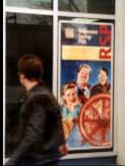
Point of Purchase (Ink-Jet)

Unleash your full creative potential! Electric Vinyl's Glow-in-the-Lite ' Perforated Marking Films PAT. will deliver Millions of additional consumer impressions ( Gross Rating Points ) for your clients after dark ', 24 hours-a-day! For example, your graphics 'won't disappear at night' anymore during the Fall, Winter and Spring months when it's dark at 4:30 PM.