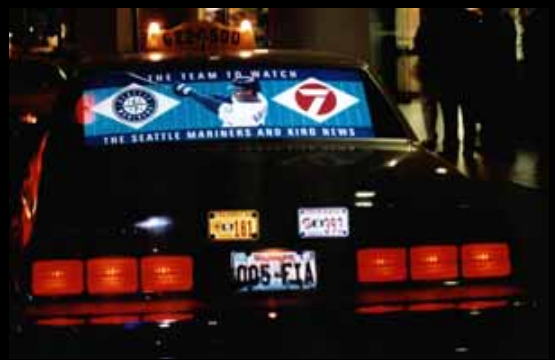
Fleet Window-Wrap (Ink-Jet)

Specify our new premium Retro-Reflective Engineering Grade film . This is only available from Electric Vinyl . Available in matched set perforated and non-perforated for the Total Fleet and Transit Advertising solution, Building Wraps too! We have numerous product lines that are compatible with Solvent Ink-Jet, E-Stat, Silk Screen and Thermal Transfer.