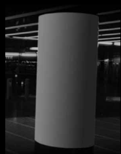
Simulation Unsightly pillars become attractive and interesting when Per'f-Alite Electric Vinyl is used.