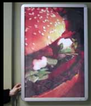
Burger by day...